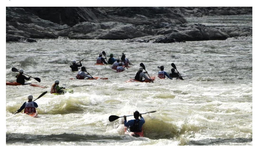
Sprint events in Nujiang (Salween river) in Lu Shui city part Classic events ( \approx 15km) from Yue Jin bridge to Lu Shui city