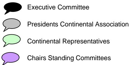
APPENDIX 4 - Location Map - ICF Board of Directors Members