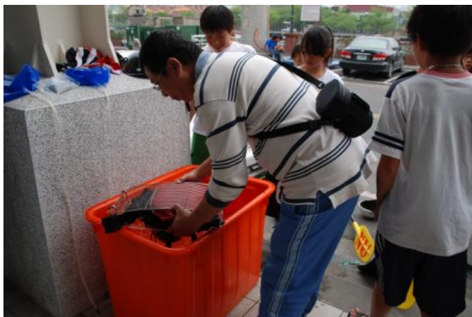
Parents help for boat control