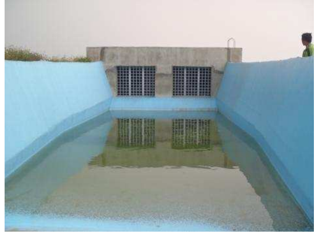
Exit of the water after pumping, beginning of the river