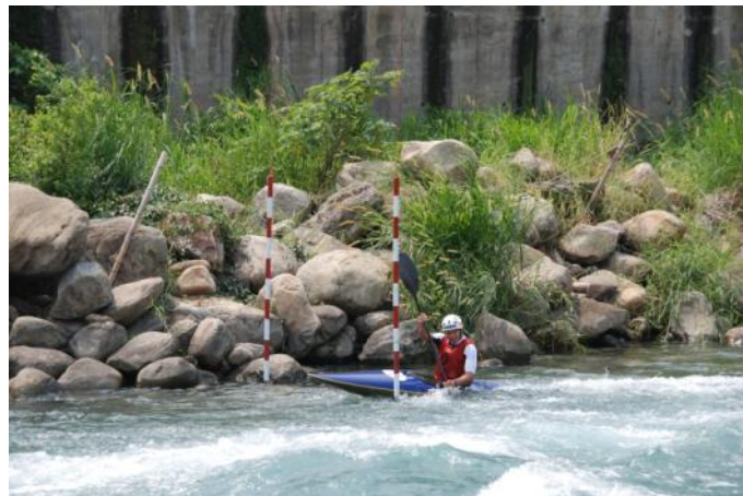
Paddler from Taichung