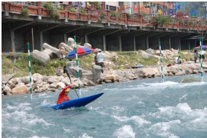
Paddler from Ilan