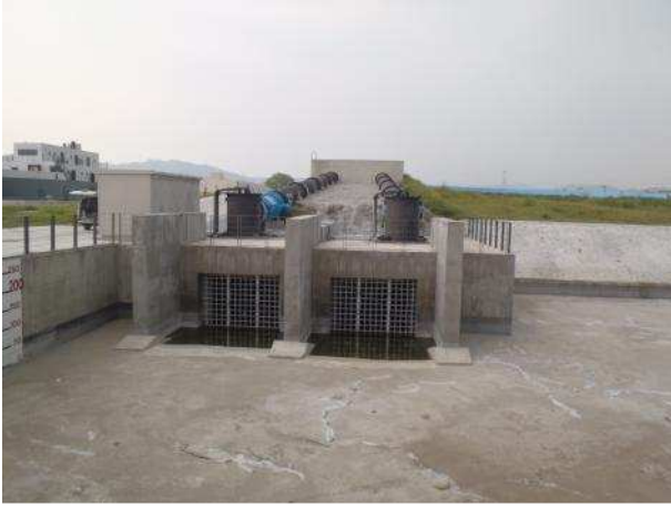
Bottom of the pumping system