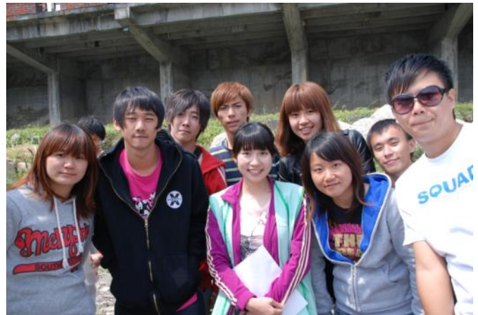
Part of the judging crew