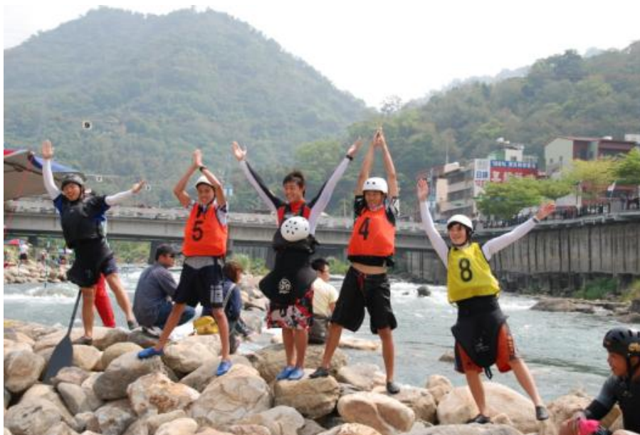
A part of Taichung team