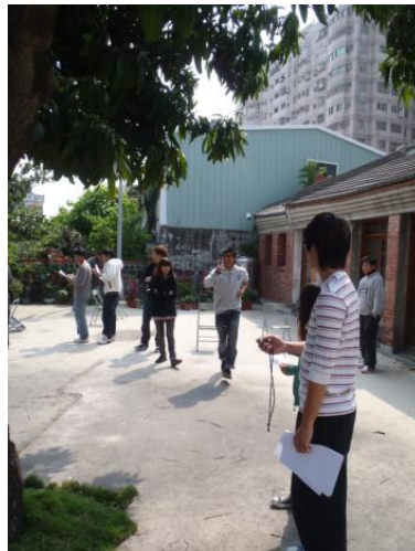
Judging and race organization test on land