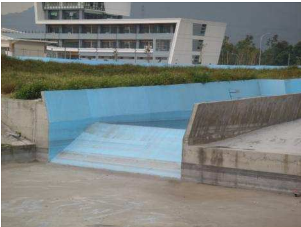
Final of the course