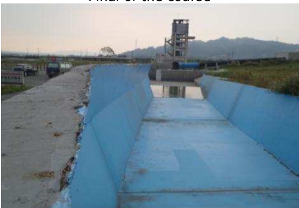
End of the river