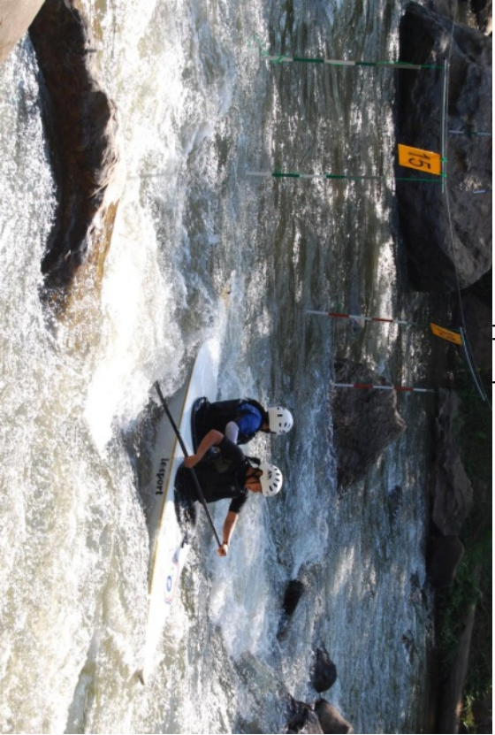
Medium part (C2 Women)