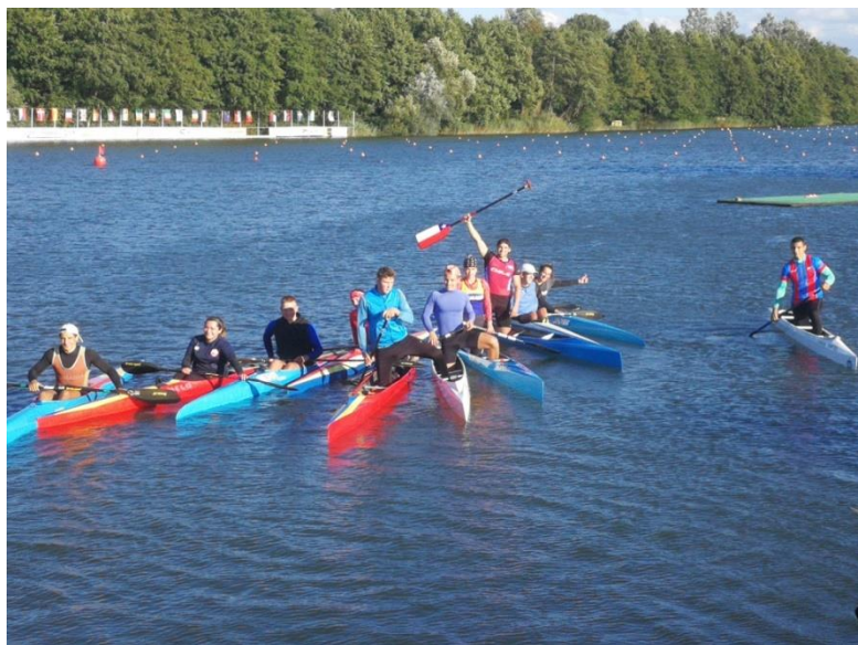
End of one training