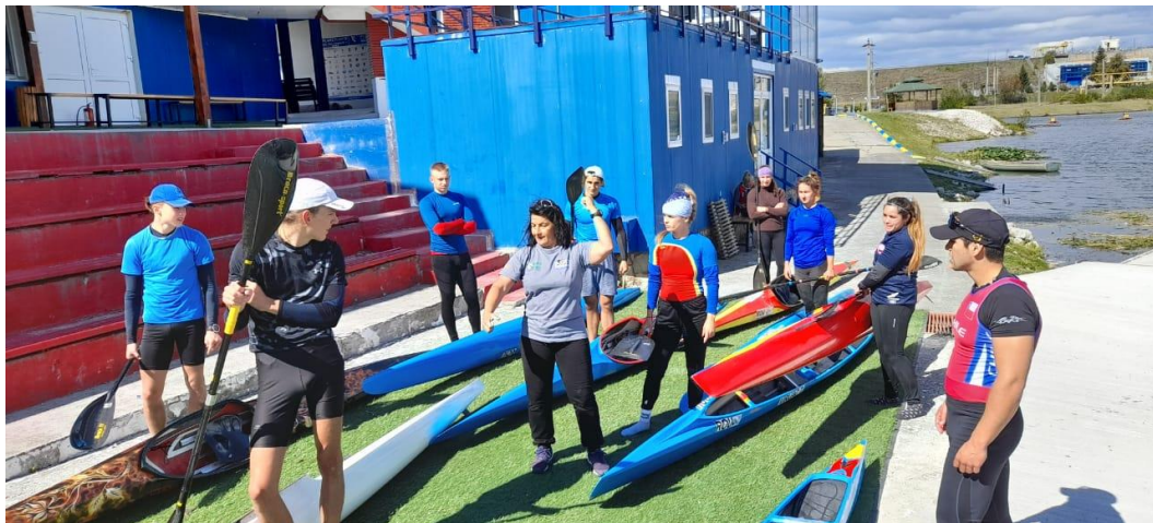
Learning different ways to carry the boat