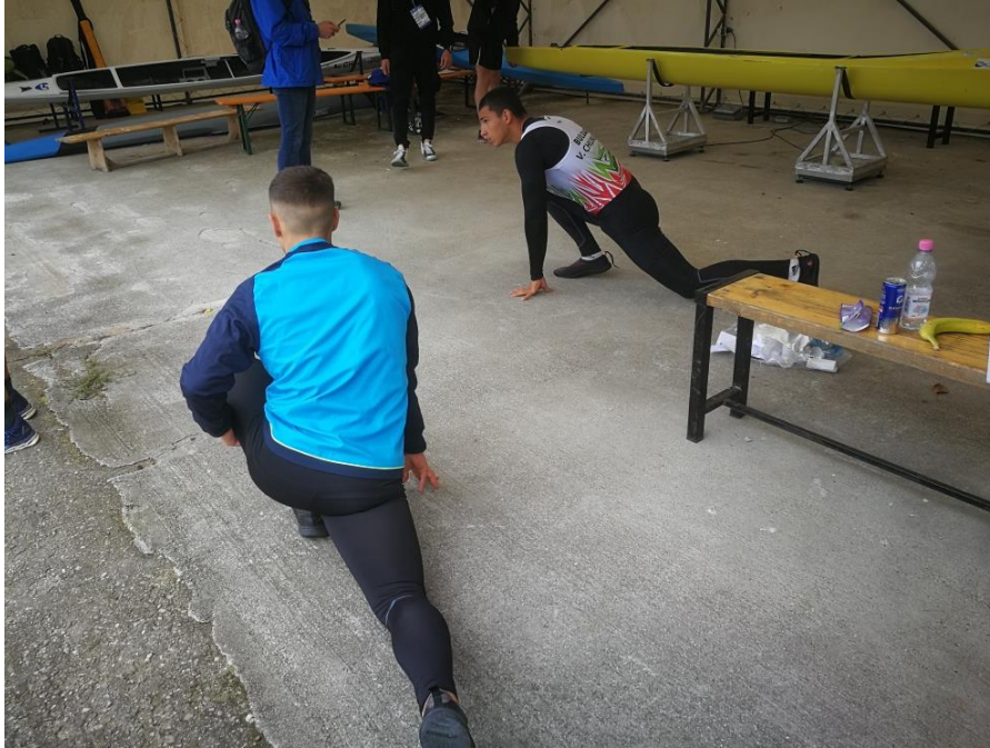
A good warm-up before the race