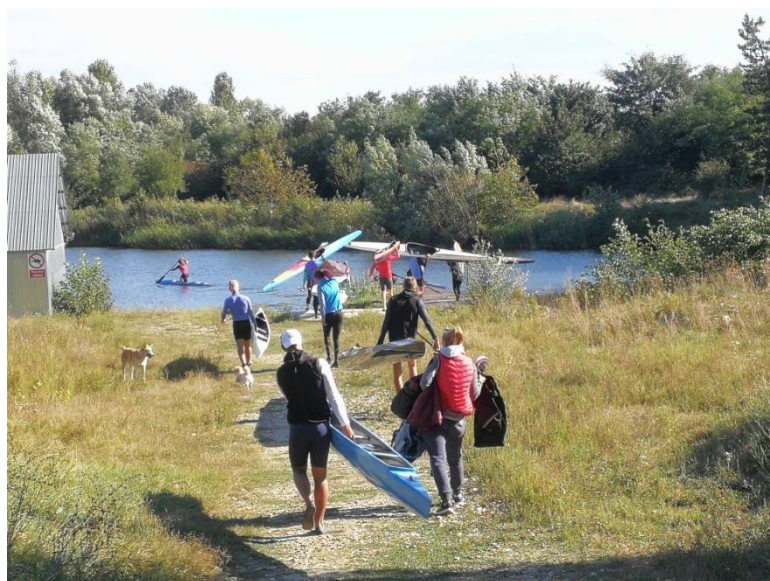
Going to the training