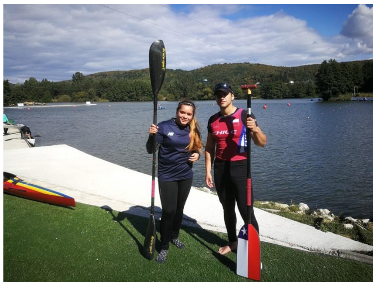
Experience for young athletes coming from very far