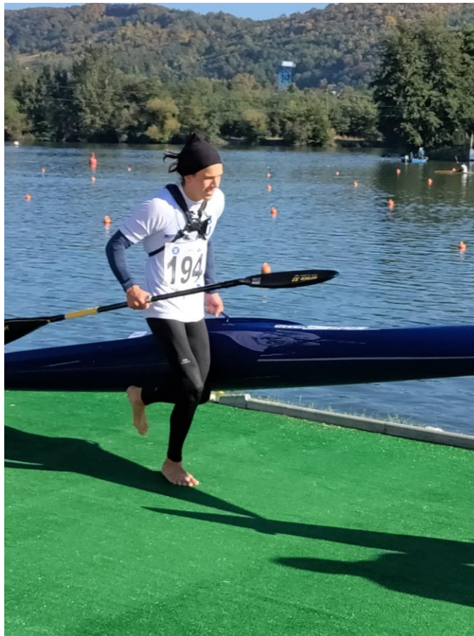
Running during the race as learnt