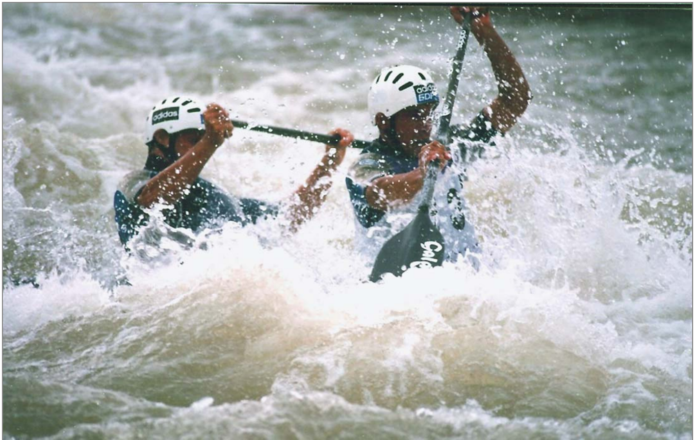
Slalom Racing C2 men