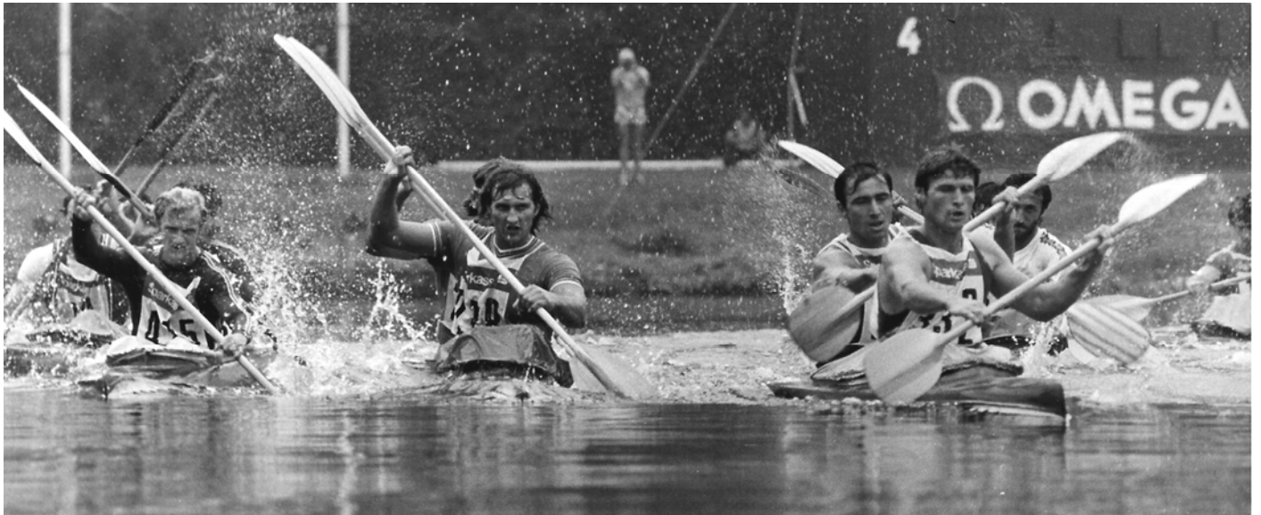
World Championships Flatwater Racing 1979 Duisburg, K2 men 10'000 m