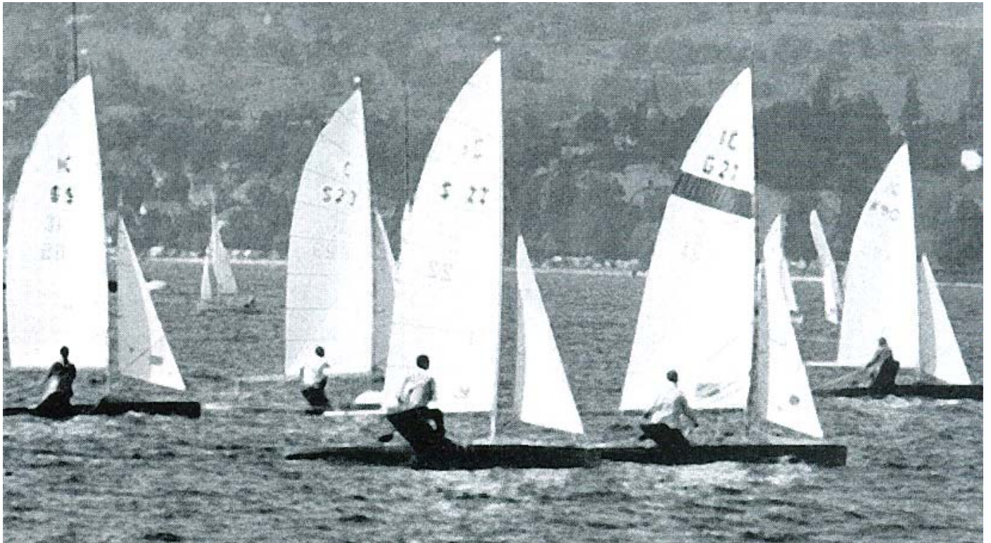
Canoe Sailing, since 1938