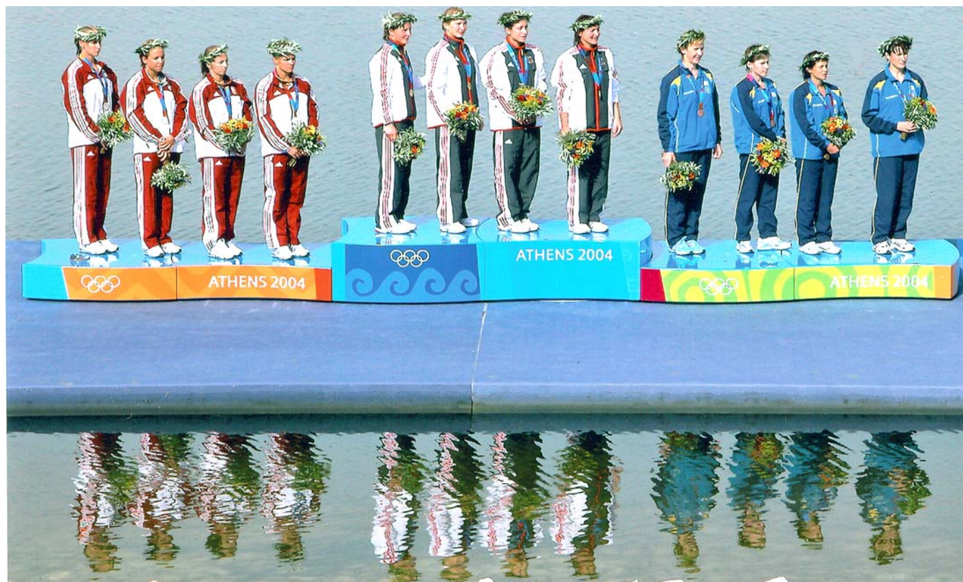
Olympic Games 2004 Athens, K4 Women 500 m, Victory Ceremony