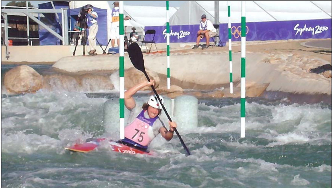
Olympic Games Sydney 2000, Canoe/Kayak Slalom Racing, K1 Men