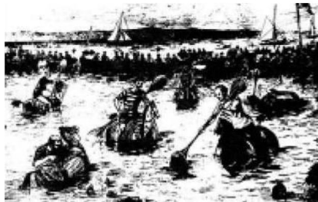
Water polo at Hunter's Quey, Scotland, The Graphic, 1880.