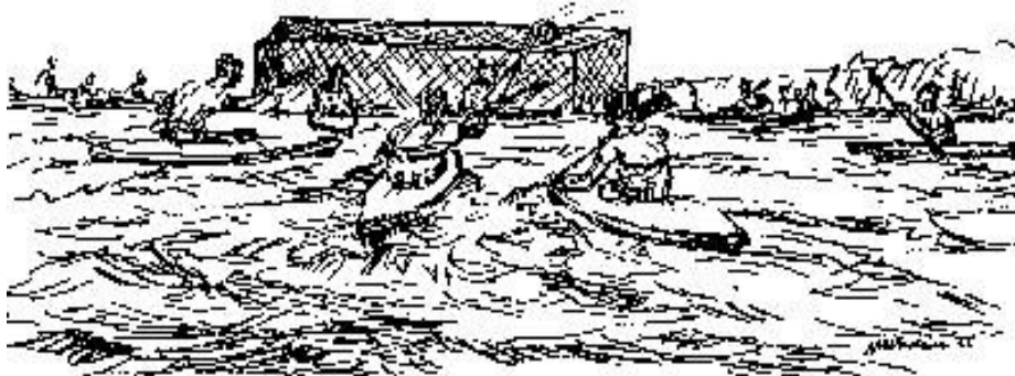
Kanupolo – Germany circa 1935. Geschichte des kanupolo, Deutsche Meisterschaften, vom 2, 5 Sep 2004