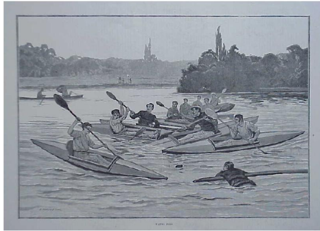
Water Polo. The Graphic, 1884.

The move to a baths setting and the creation of the BAT together provided the impetus to reshape the