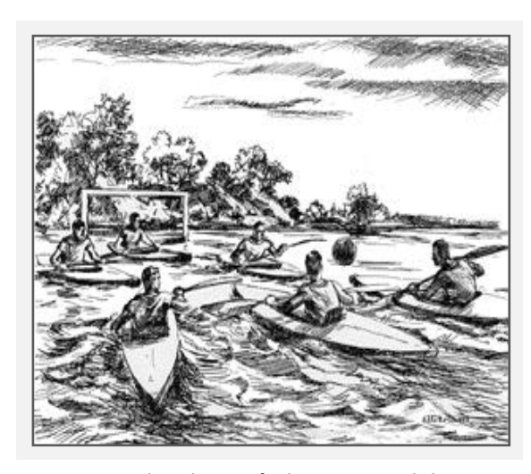
Canoe polo in the 1929 final, artist: Artur Nikolaus Source: Kanu Sport 1930, German Canoe Federation