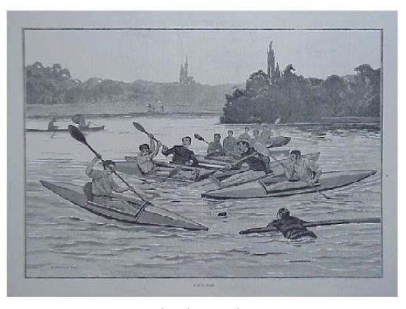
Water Polo. The Graphic, 1884.

For many years canoe polo had been played on rivers and lakes in a variety of craft, on different sized fields, to different rules, under different names, and for different reasons. There was little need to change what was an enjoyable and challenging activity.