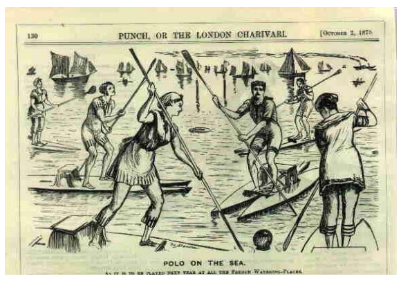
Polo on the Sea. Punch, or the London Charivarl, 2 October 1875.