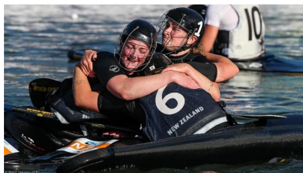
And a great post-worlds TV interview