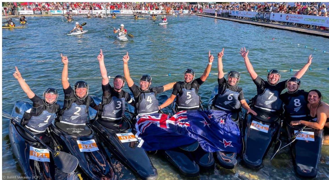
2022 ICF Canoe Polo World Champions - New Zealand U21 Women