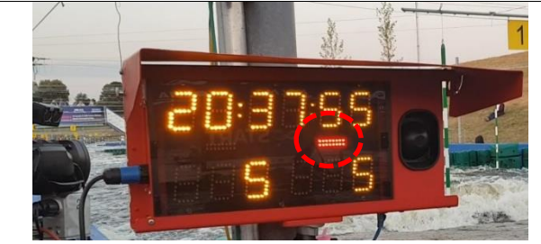
Red light \rightarrow the athlete <u>can't</u> leave the start position