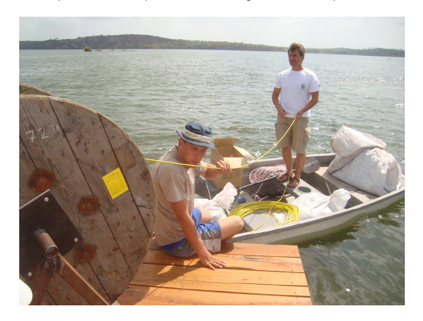
Racing course installed by Polaritas Ltd of Hungary.