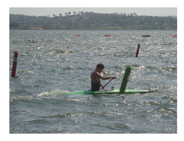
C1 -OBSATACLE CANOE SLALOM racing course