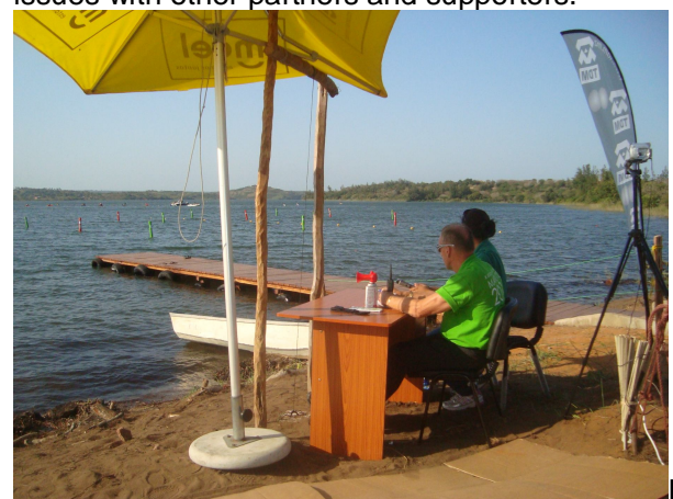
Finish Line Judges.