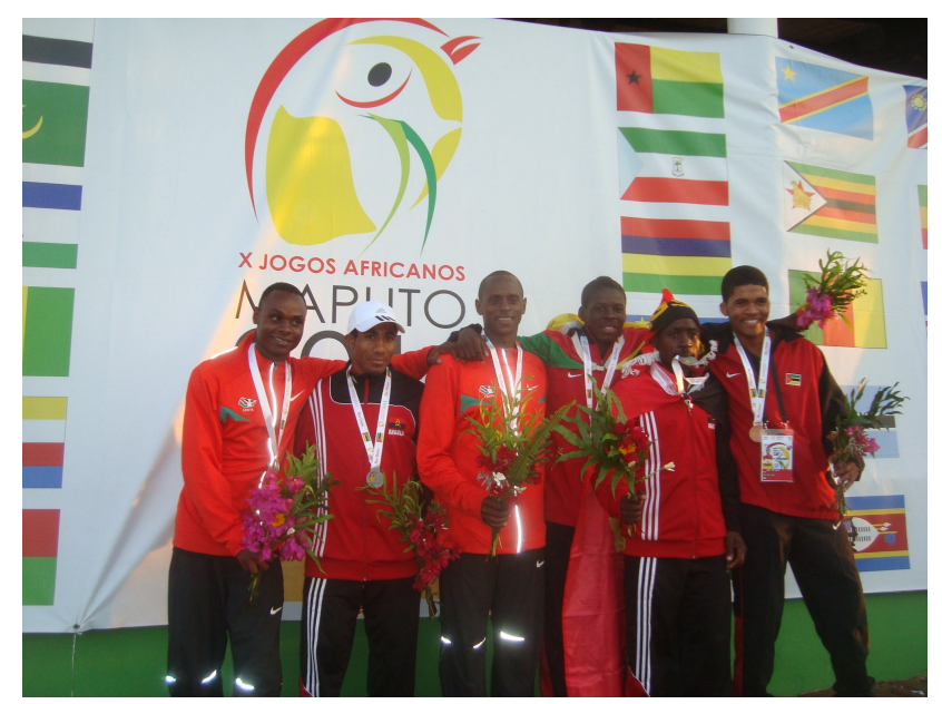
Medallist; C2 men ; KEN(G), ANG(S), MOZ(b)