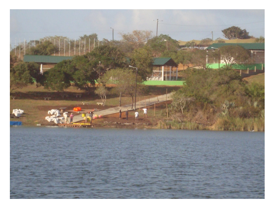
All Africa Games –Venue and Infrastructure Overview

b) Venue infrastructure and buildings were either completed at the last minute or in some cases not completed, some unwanted structures were built or hired which had little or no use for the canoeing competitions. While COJA managed to bring in temporary structures such as mobile Offices, Toilets, Tents and various other facilities it was not able to provide basic requirements such Video Camera, Megaphone, Boat Numbers, or weighing scale required for the Competitions and these were borrowed from South Africa Canoeing federation.