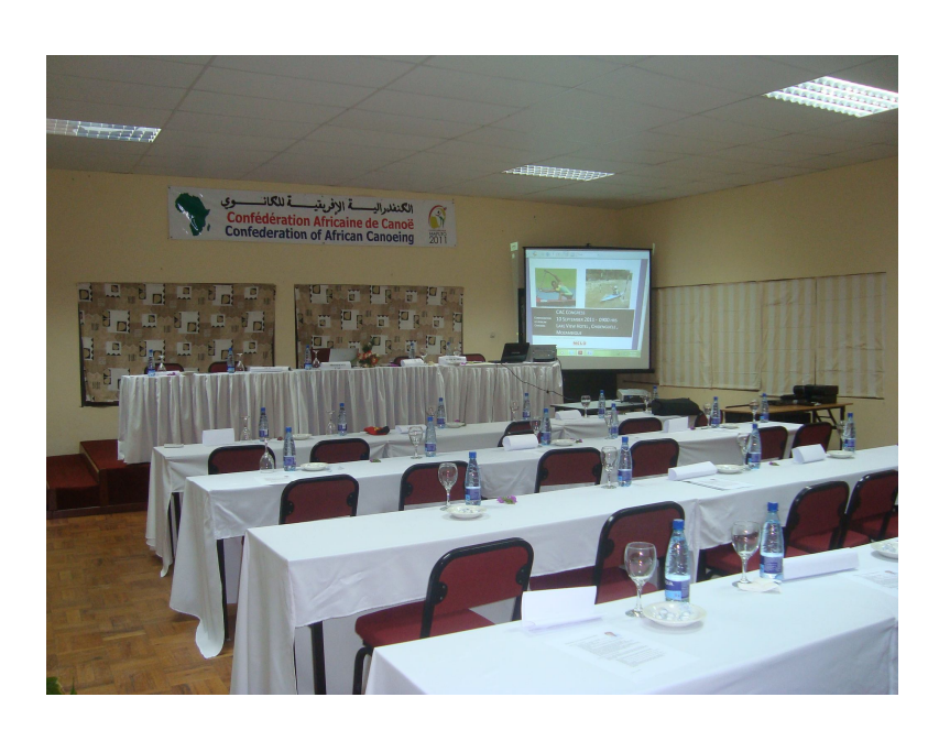
2011 CAC Congress Hall, Lake View Hotel, Chidenguele, Mozambique