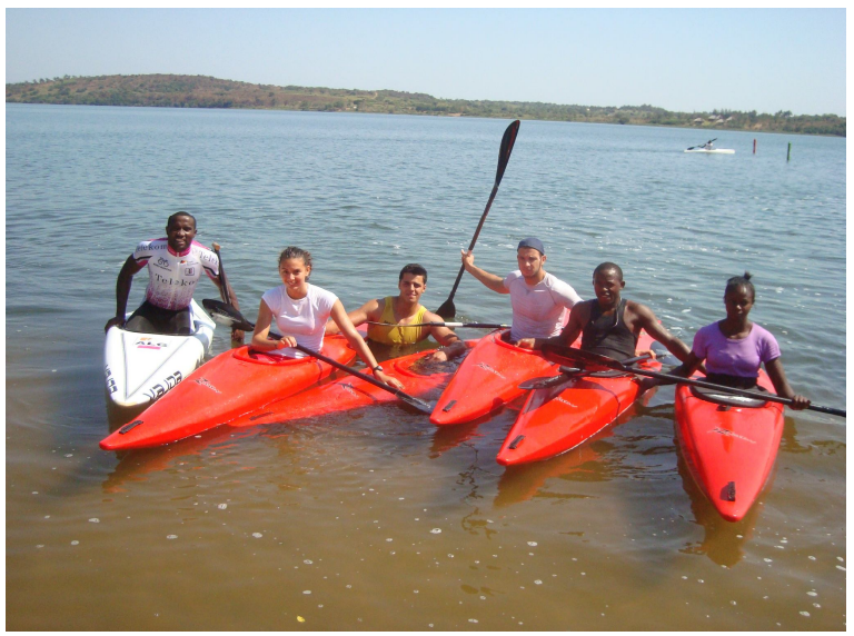
Obstacle Slalom Paddlers: