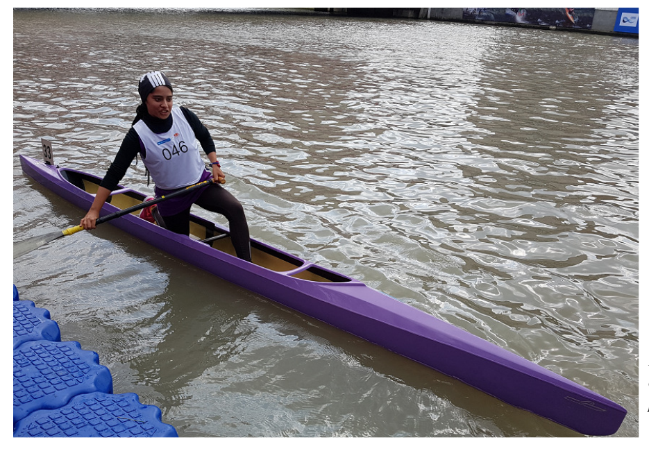
Iran took part in the event with a team of women junior C1 paddlers