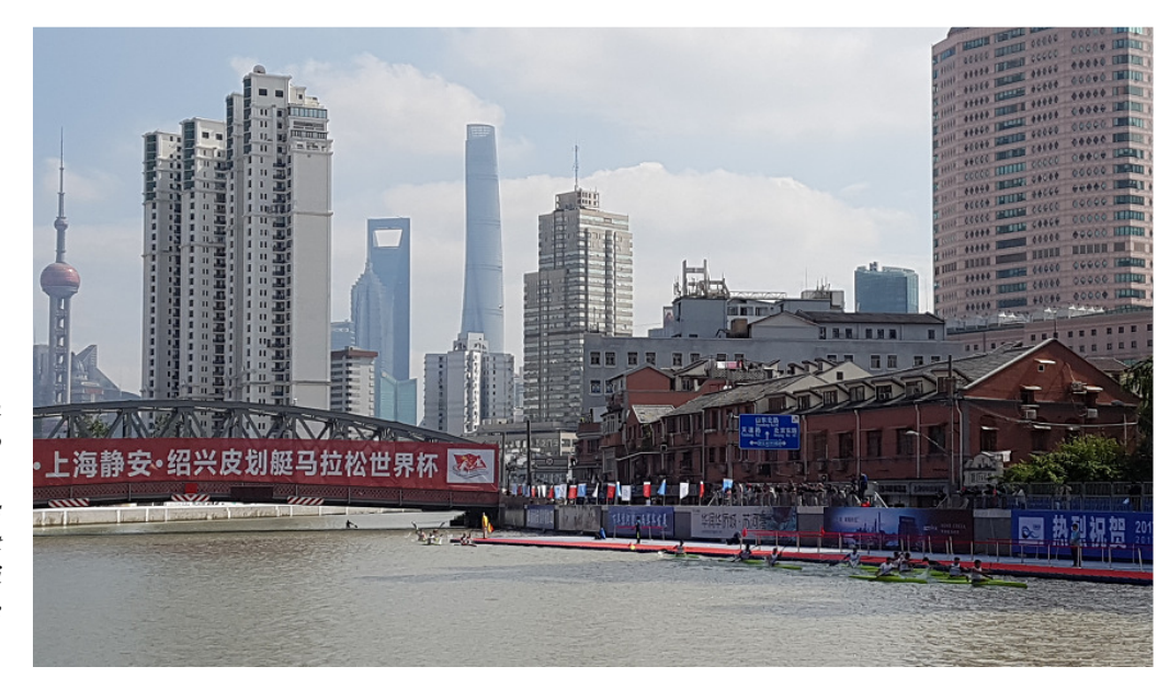
The course in Shanghai was also in the city centre. The World's second-tallest building, Shanghai Tower in the background.