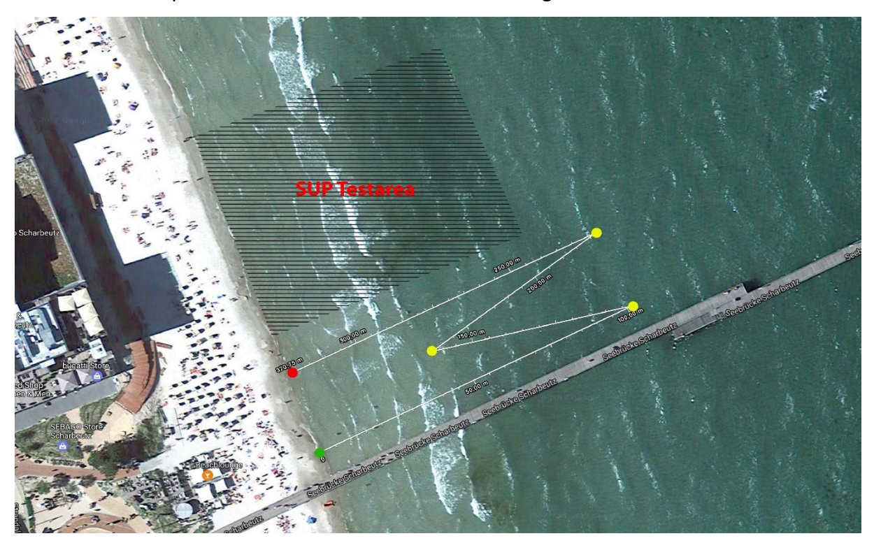
2.2.2. Long distance – Beach in front of the Seabridge