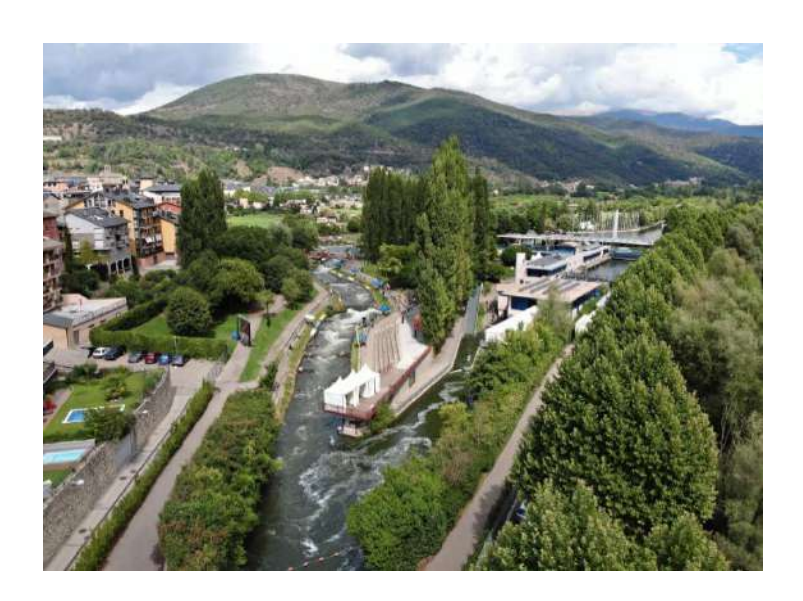
1st Newsletter 2021 SEGRE Canoe Slalom CUP

The drop in the Slalom course is created naturally via channels that branch from the river Segre, with a very gentle slope. The feeder canal, 165 in length, and mainly the flat water canal, 650 m in length and 20 m in width, are set aside for training in flat water canoeing and the necessary practice that sport lovers require in waters with a steady current.