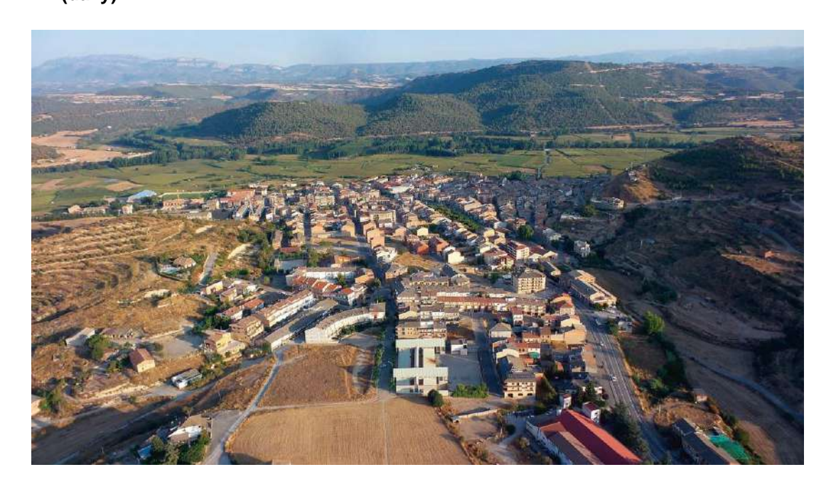
1st Newsletter 2021 SEGRE Canoe Slalom CUP