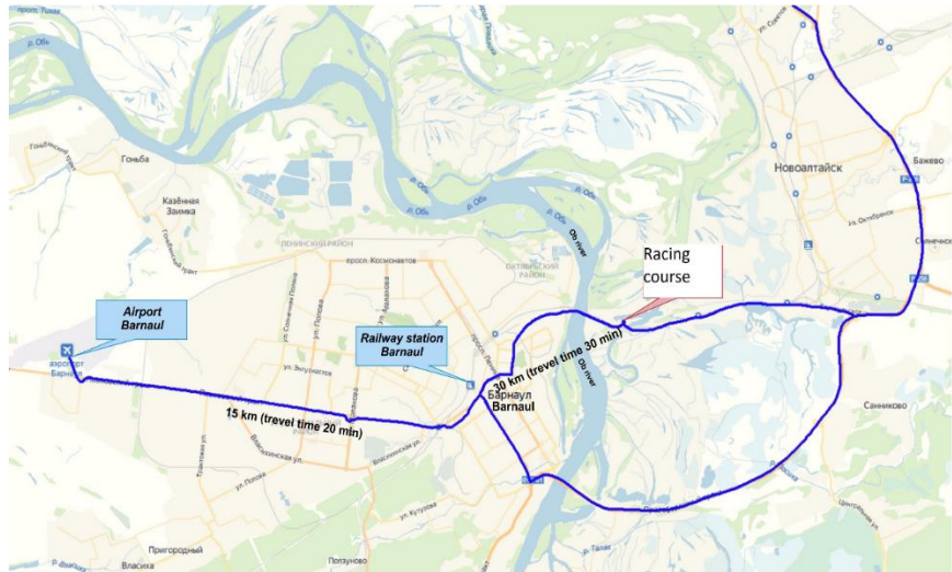
2021 ICF CANOE SPRINT WORLD CUP BARNAUL (Map with the location of airports, rail network and roads to the venue/city)