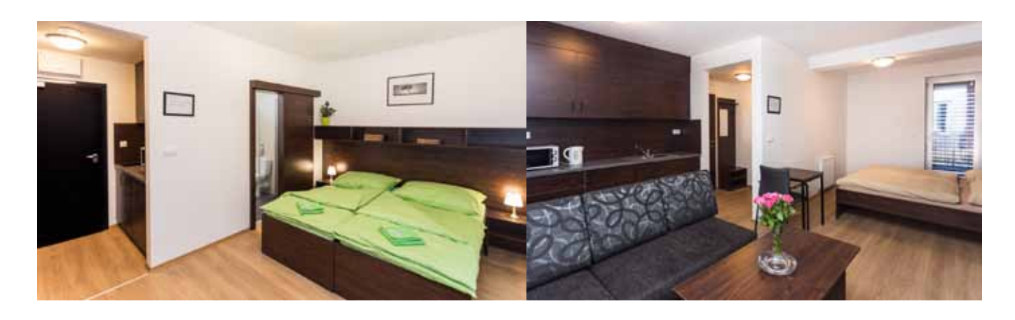
Category 2: Double room: 70 EUR/ person Single room: 80 EUR/night Dominika - 15 minutes drive, http://www.hoteldominika.sk Divoká voda - 20 minutes, https://www.divokavoda.sk/ubytovanie/ Penzion Rusovce https://www.rusovskypenzion.sk/-home

Category 1: Double room: 80 EUR/ person Single room: 95 EUR/night Barok Apartments - 8 minutes drive, http://www.barok.sk Berg - 15 minutes drive, https://www.penzionberg.sk Lindner - 25 minutes drive, location in city centre https://www.lindner.de/sk/bratislava-hotel-gallery-central/vitajte.html Vienna House https://www.viennahouse.com/en/easy-bratislava/the-hotel/overview.html