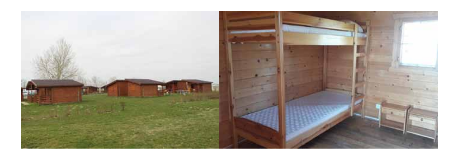
Category 4: Quadruple room: 40 EUR/ person Single room: 60 EUR/night Bungalows Divoká voda - 20 minutes drive, https://www.divokavoda.sk/ubytovanie/