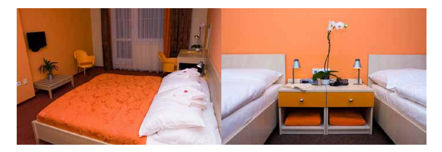
Category 3: Person: 55EUR/night, Single room: 70EUR Modrá čajka - 20 minutes drive, http://www.yachter-cajka.sk Apartment Santino https://www.santino.sk/ Penzión pri kaštieli http://www.bratislavapenzion.sk/