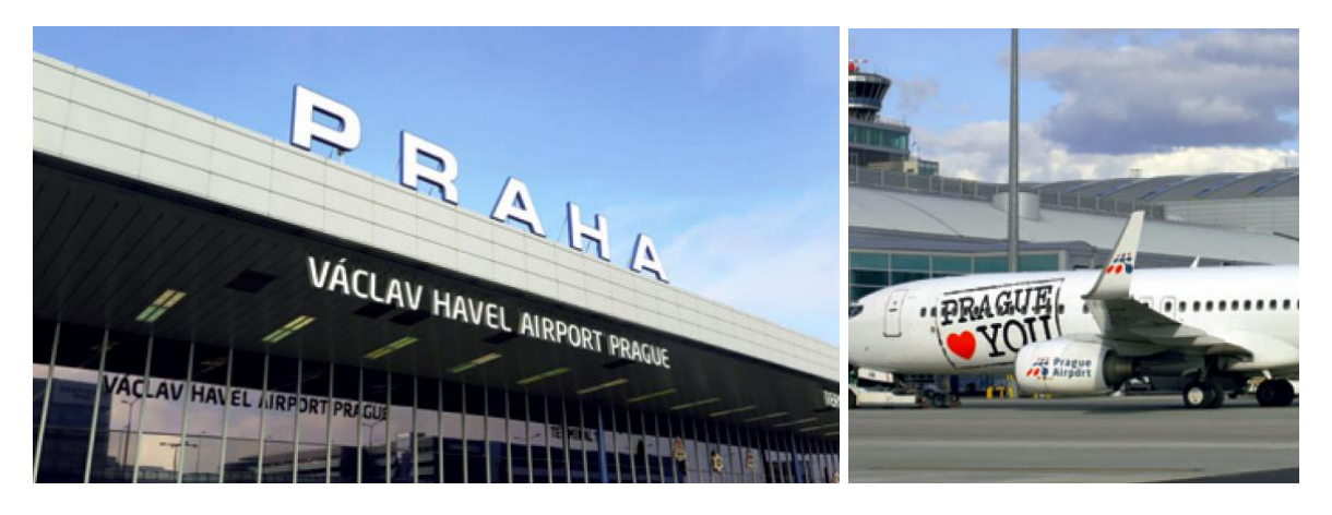
From Václav Havel International Airport Prague (PRG) to Prague Troja Venue it is about 20 km, approx. 40 min.

International Airport - Václav Havel Airport Prague (PRG) is a flight hub used by more than 40 airlines that travel to hundreds of destinations. It has three passenger terminals. Terminal 1 is used for flights outside the Schengen zone, while Terminal 2 is used for flights within the Schengen zone and Terminal 3 is for private and charter flights. You can get all the relevant information on the non-stop phone lines +420 220 111 888.