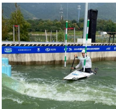
Start position -Short Slalom