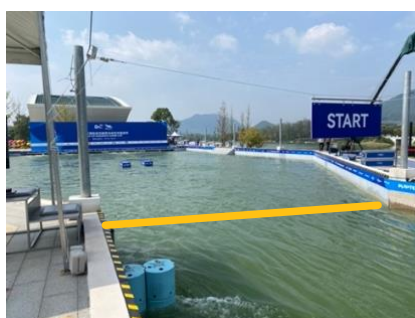
Start position & beam line- Classic Canoe Slalom