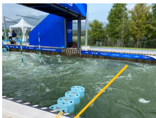
Classic Format Finish