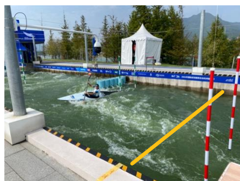
Beam Line – Short Slalom