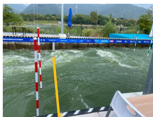
Short Slalom Finish