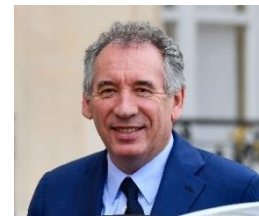
François BAYROU, Mayor of Pau