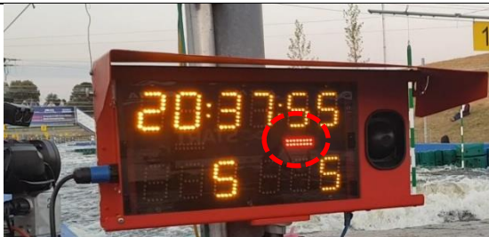
Red light → the athlete can't leave the start position