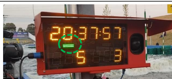
Green light → the athlete can leave the start position