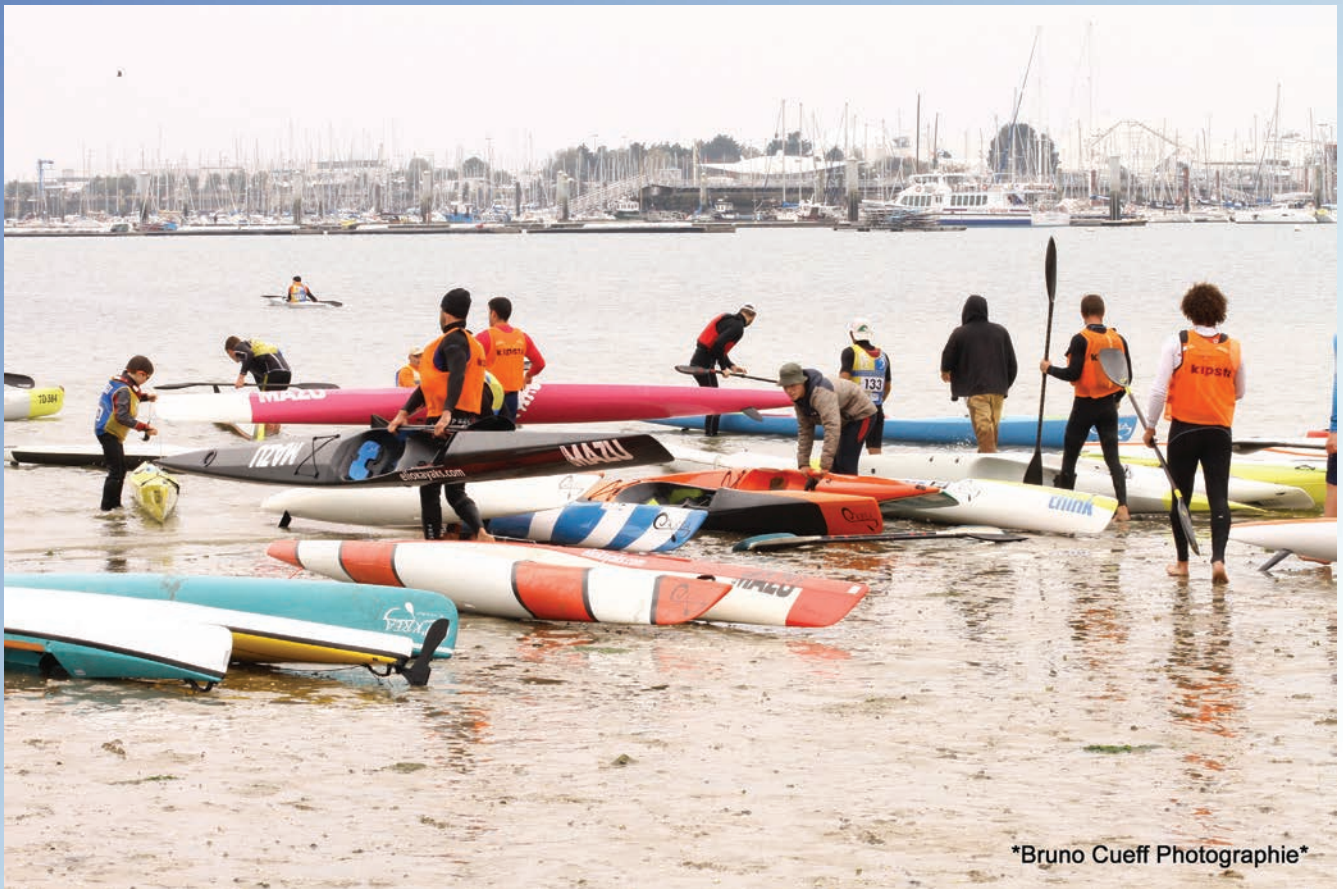
*Bruno Cueff Photographie*