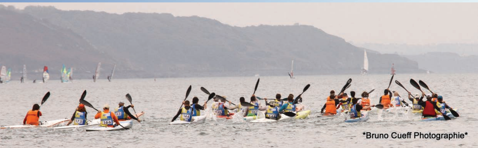
*Bruno Cueff Photographie*