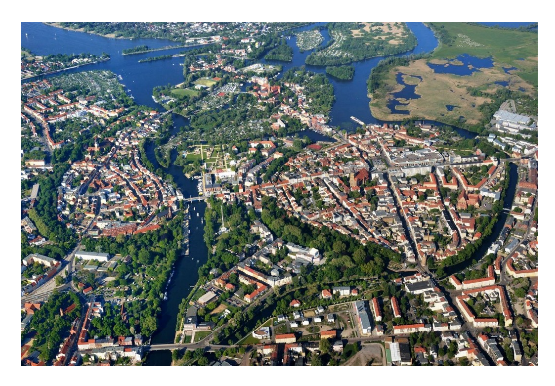
Illustration 1 Brandenburg an der Havel with its three historic city centres

Brandenburg an der Havel is where beautiful landscapes meet and offer seven nature reserves. Storks, cranes, eagles, herons, kingfishers and beavers are at home in this beautiful, Mark Brandenburg landscape. Venue Brandenburg an der Havel in Germany.