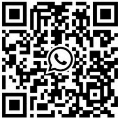
World Champs, Durban RSA Admin Group