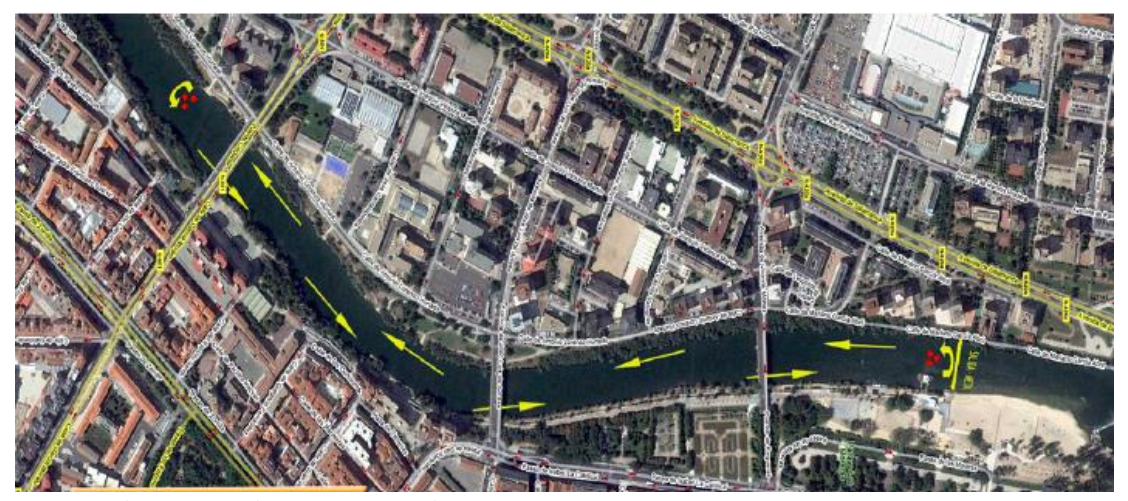
Pisuerga River Valladolid 5.000m: 2 turns over