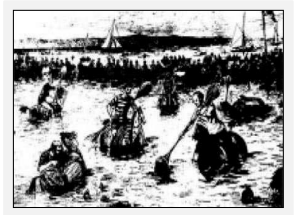
Water polo at Hunter's Quay, Scotland , The Graphic , 1880.