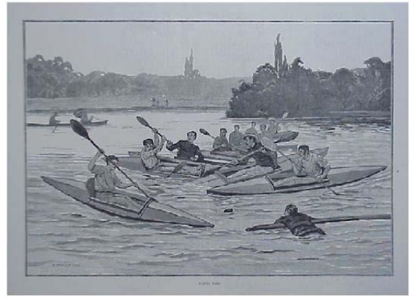
Water Polo. The Graphic , 1884.

An international competition beckoned. An enthusiastic following had grown through the schools in England and canoe polo played in swimming baths was an emerging national sport. It was introduced as a demonstration sport at the Crystal Palace Exhibition , London in 1970 and caught the imagination. Such was the interest that the first English National Championships were held at the National Canoe Exhibition in the following year. Subsequently, the championships were