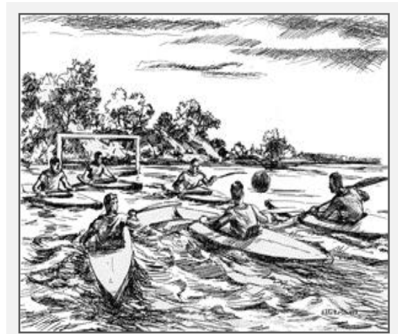
Canoe polo in the 1929 final, artist: Artur Nikolaus