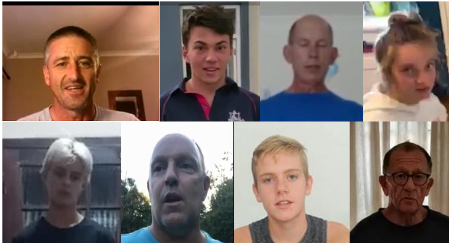
Online Session in progress