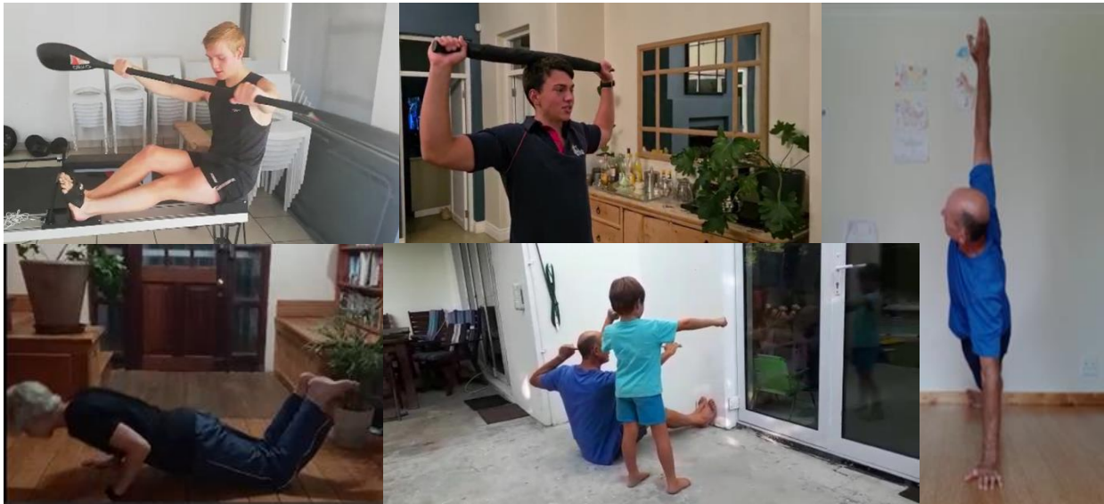
Coaches in action

Feedback at the end of the course indicated that the majority of the coaches expectations were met and that the information shared was worthwhile and could be used in their preparations and training sessions. One aspect which was identified for improvement was centred on providing an opportunity for the coaches to analyse the technique of paddlers out on the water and provide feedback and or corrective input to the athletes concerned. This is normally incorporated into the sessions that I run with coaches in person, and has been an element not touched on via the online experience and I will therefore be considering how to add elements of this to the virtual training platform, potentially through the use of video footage and analysis.