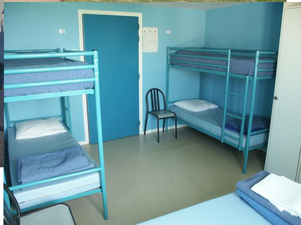
Rooms are composed of 1 to 5 beds.