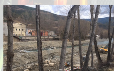
State of the river a month after the beginning