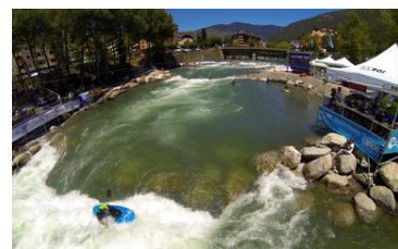
Freestyle Stadium until now, before the works

We hope everyone it's going to enjoy it and we are open to any suggestion or opinions during the championships.