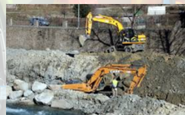
State of the river at the beginning of the works