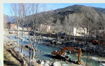
State of the river at the beginning of the works