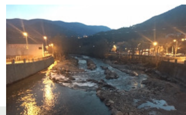
State of the river a month after the beginning