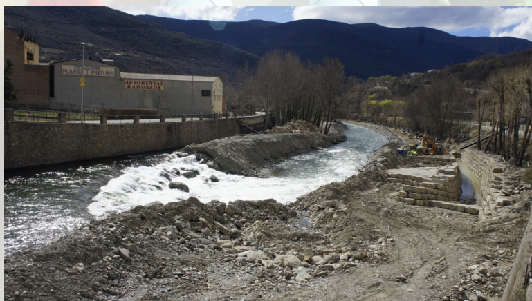
State of the works on 19th March.