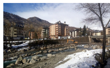
State of the river at the beginning of the works