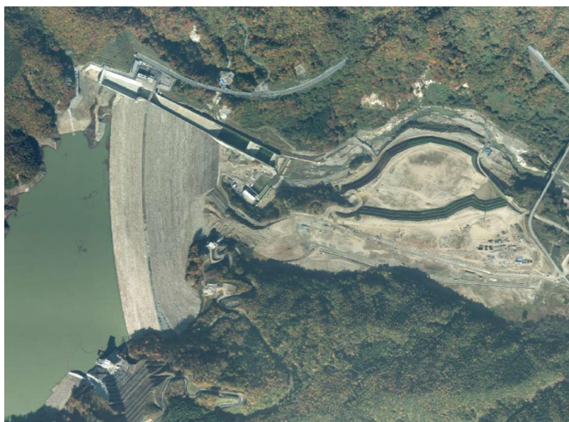
Aerial photo of the course