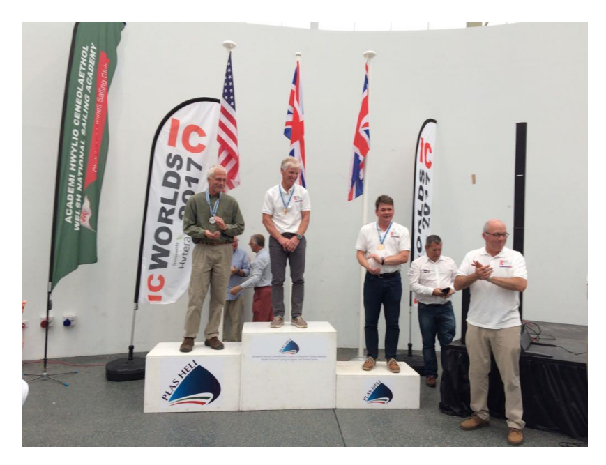
2017 World Canoe Sailing Champion – Medal presentation