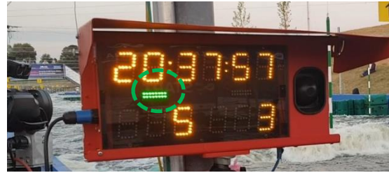
Green light → the athlete can leave the start position