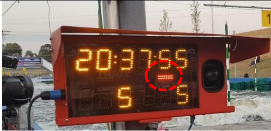
Red light → the athlete can't leave the start position